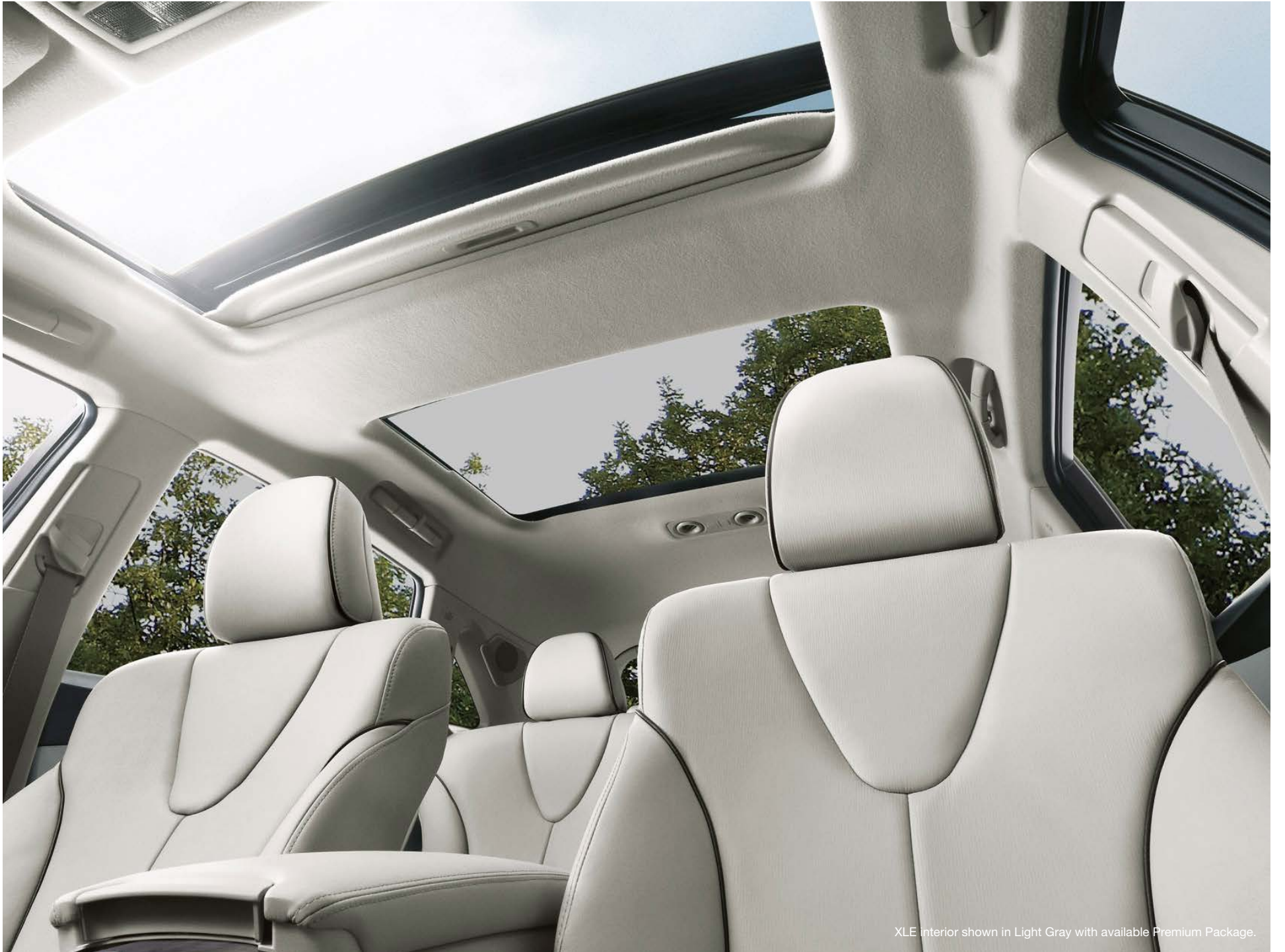
XLE interior shown in Light Gray with available Premium Package.